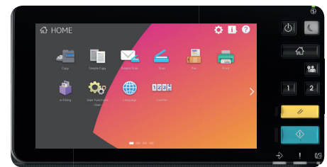
Customised to display up to 18 icons per page and with a different background.

Card Readers for these models are optional and can even be installed discreetly behind the cover of the systems. They not only give you fast and convenient access to your print jobs but also increases data security.